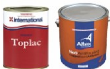
PAINT & MAINTENANCE