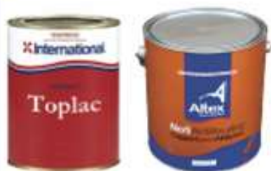
PAINT & MAINTENANCE